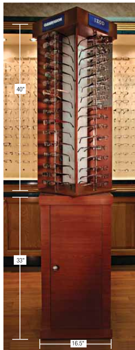
64 piece rotator

In a beautifully rich mahogany laminate, this rotator features a mirror and graphic panel on all four sides with cabinet space in the base of the display. Available Spring 2011.