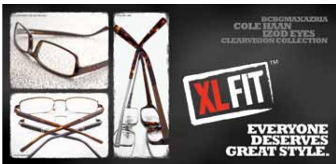
xl fit counter card

image: adam, grace, ashley, tony *new image coming winter 2011