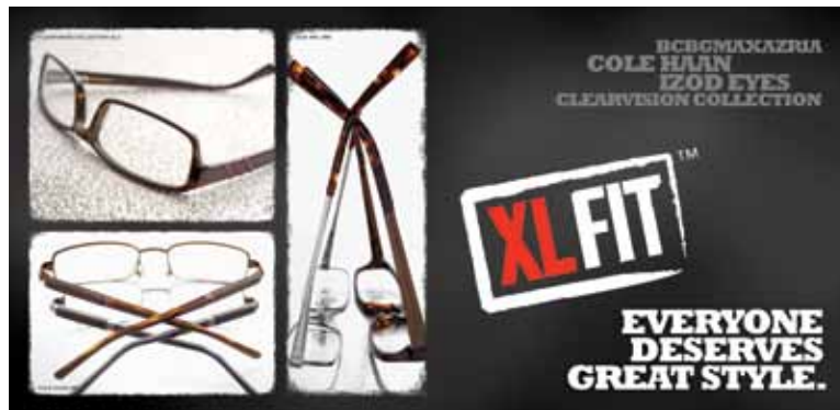
xl fit counter card