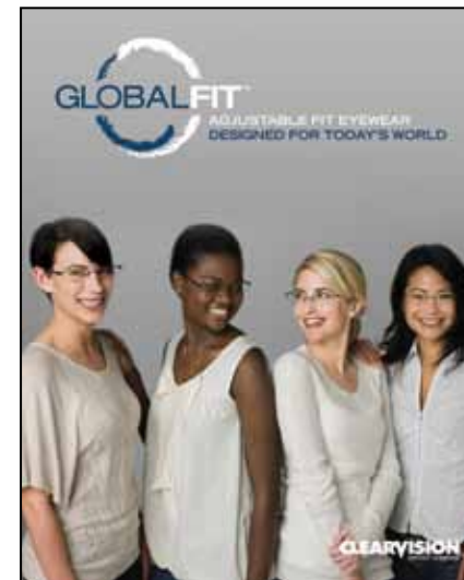
global fit counter card