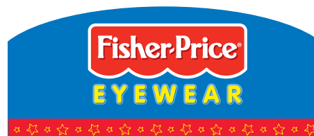
frame board highlighter 6.5" x 2.75"