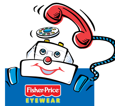
telephone counter card 11" x 10.25"