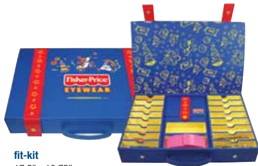
fit-kit 17.5" x 10.75"