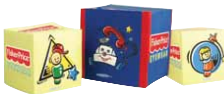
foam block brand ids (2) 3" yellow blocks (1) 4" blue block