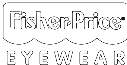
fisher-price® logo window cling 5" width